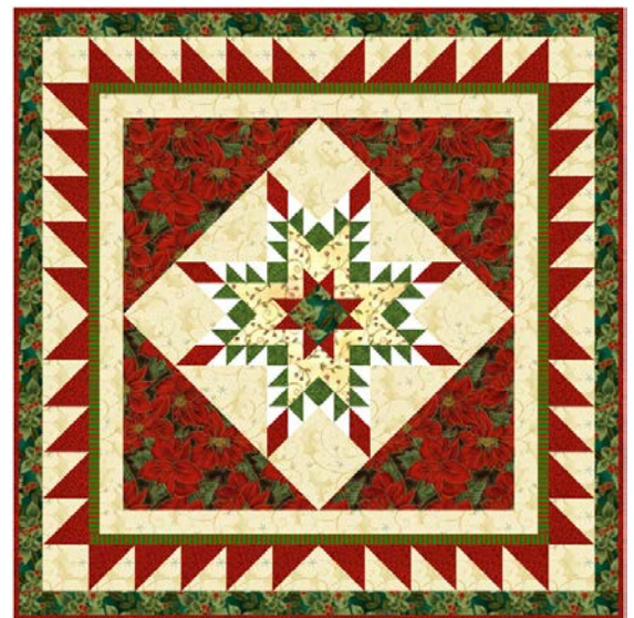
Finished size: 26" x 26"