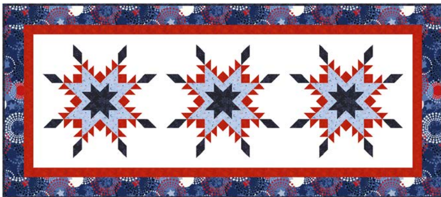
Table runner: 20" x 46"

This quilt sparkles with traditional charm. Step-by-step instructions include paper-piecing techniques for accurate triangle squares and perfect piecing results. Nancy's tips and techniques make short work of this tricky-looking block. This is an ideal class, for anyone who wants to improve their piecing skills. Design and color possibilities will be included in the class.