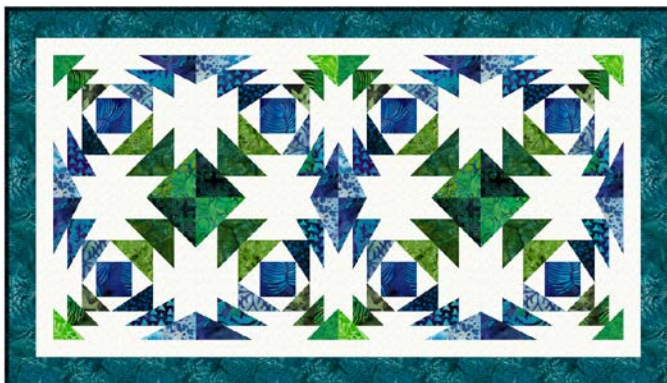
Table runner size: 21" x 37"

Create a dynamic design with this off-center Pineapple block, while learning all the tricks of foundation paper piecing. Create a different look by using your own colors, adding a plain border, or making a smaller project. In this class, all aspects of foundation paper piecing will be covered, including how to measure, cut, and correctly position the right fabric piece. This is a great class for mastering foundation paper piecing!