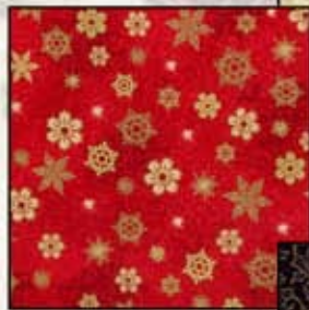
K7170 231G- Garnet/Gold