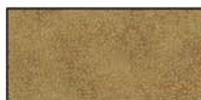
J9216 A64G-Antique Tan/Gold